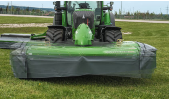
Smooth-running guards which swing upwards make a huge difference to cleaning and maintenance. All Fendt Cutters are very easily accessible.