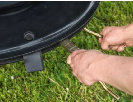
Adjust the cutting height of the Fendt Cutter in seconds.