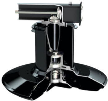
The drums' robust cast metal bearing housing and the 5-race bearing ensure durability and smooth running.