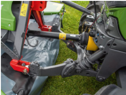
The Fendt Cutter FPVs are fitted close to the tractor. This ensures better ground following and provides more safety on steep gradients on the roads.