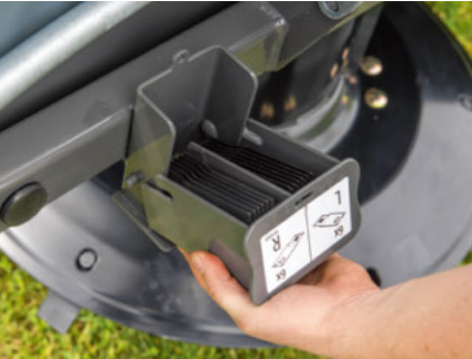
The knife box is perfectly integrated on the mower.