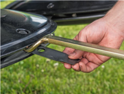
The quick-change system with practical special tool makes changing the knives child's play.