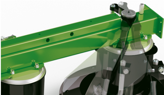
The Cutter FPV U profile mower mount is designed for maximum durability, and is unaffected by load peaks on the sides.